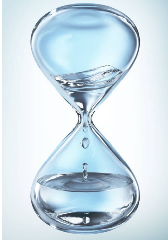
Tea light extraction