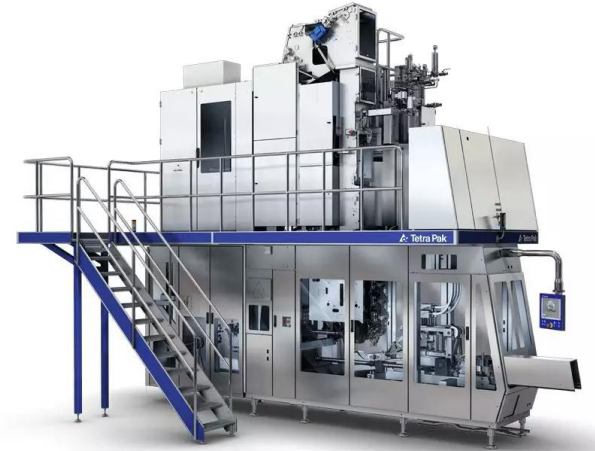
Sterile box packing